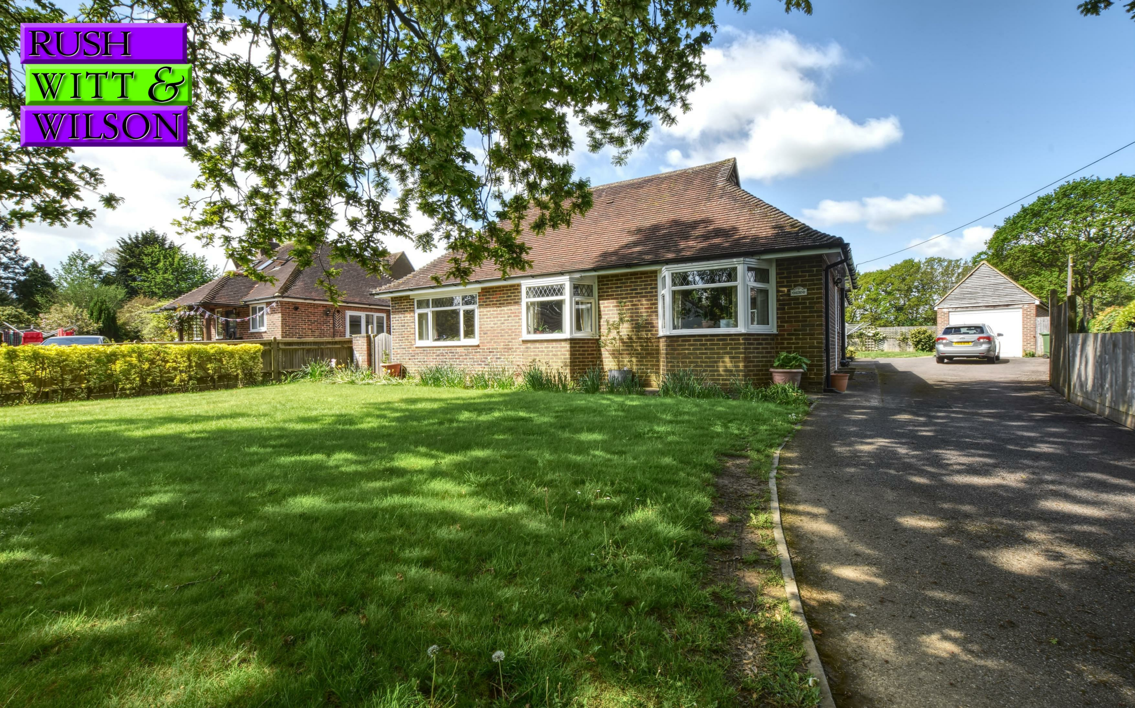
Oakdene Sandhurst Lane, Bexhill-On-Sea, East Sussex TN39 4RH £675,000